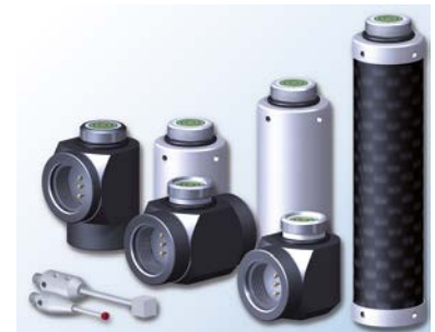
Various accessories available