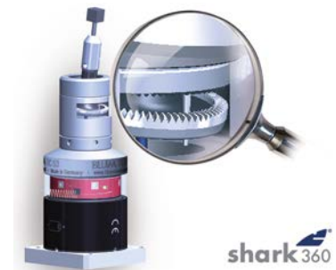
shark360 measuring mechanism

* Depending on geometry and material of tool. Probing force must not result in damage of tool