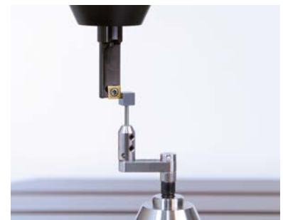
Tool radius measurement with special probe configuration